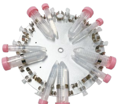
Tube is sold separately