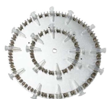
Tube is sold separately